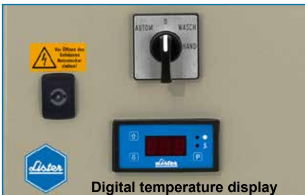
Digital temperature display