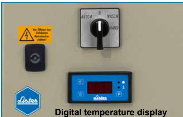
Digital temperature display